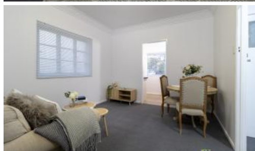
Unit 5, 3 Grattan St, Woolloongabba