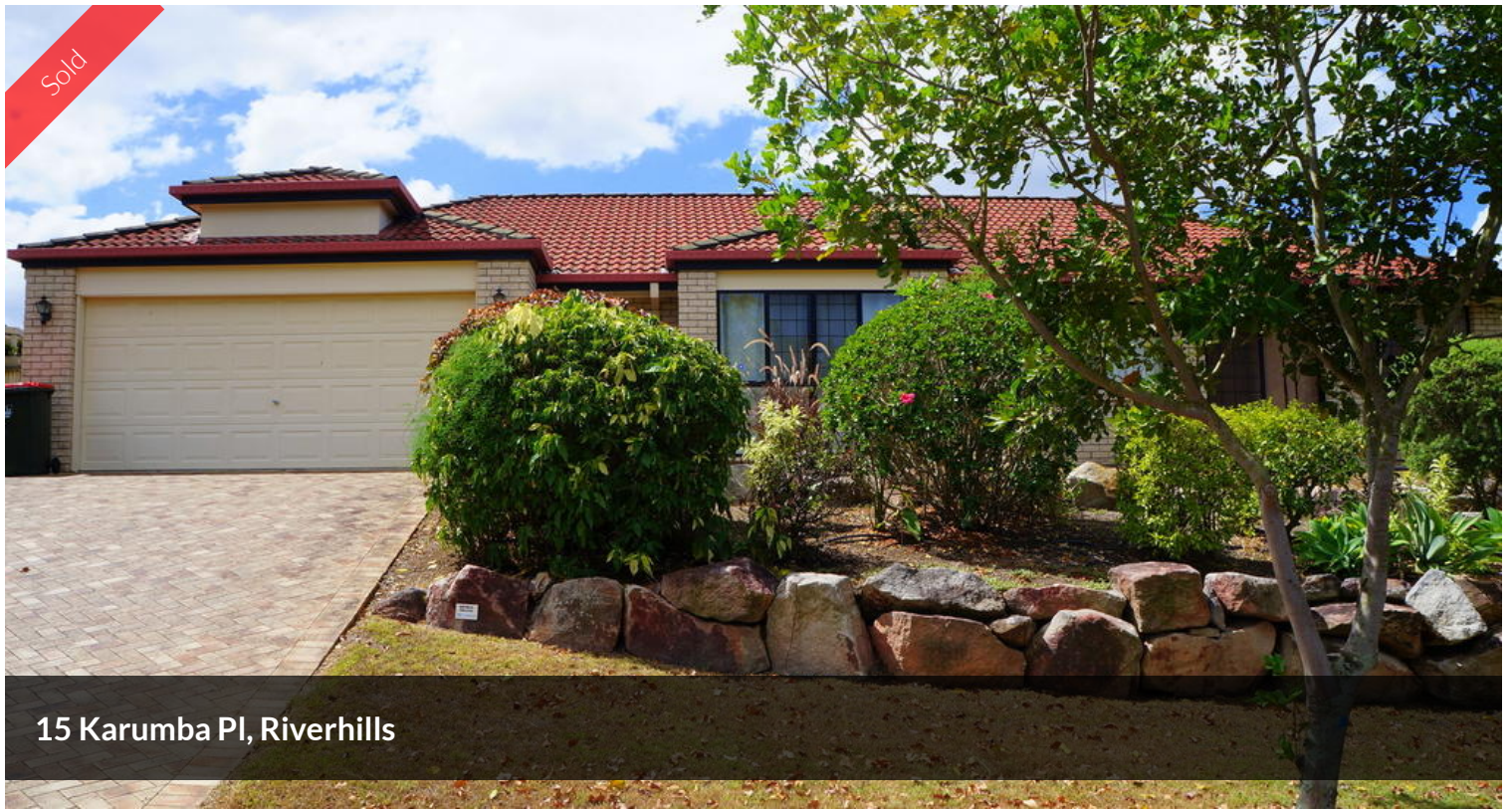
15 Karumba Pl, Riverhills