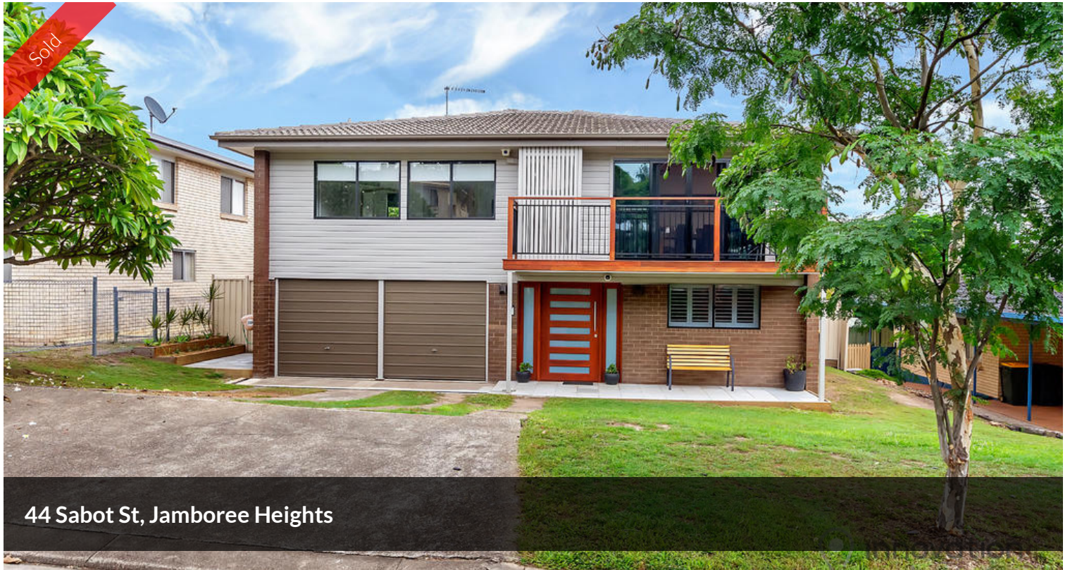
44 Sabot St, Jamboree Heights