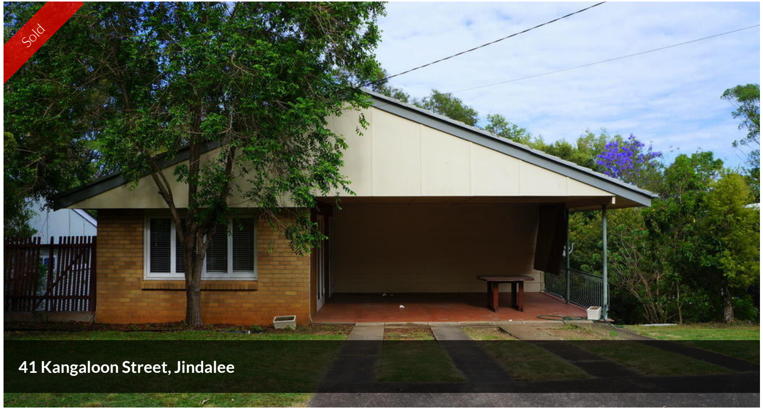
41 Kangaloon Street, Jindalee