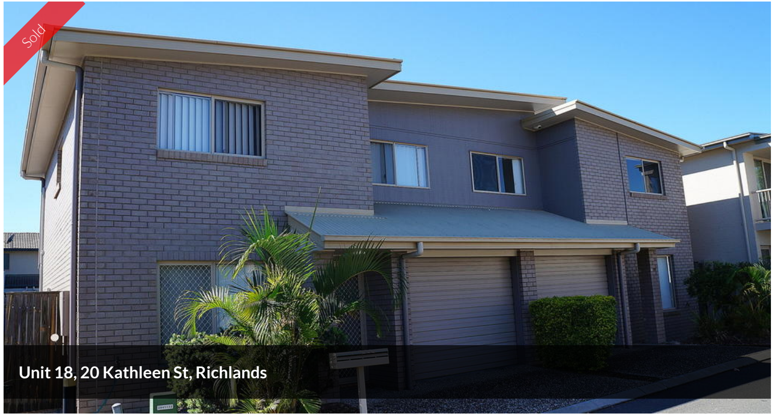
Unit 18, 20 Kathleen St, Richlands