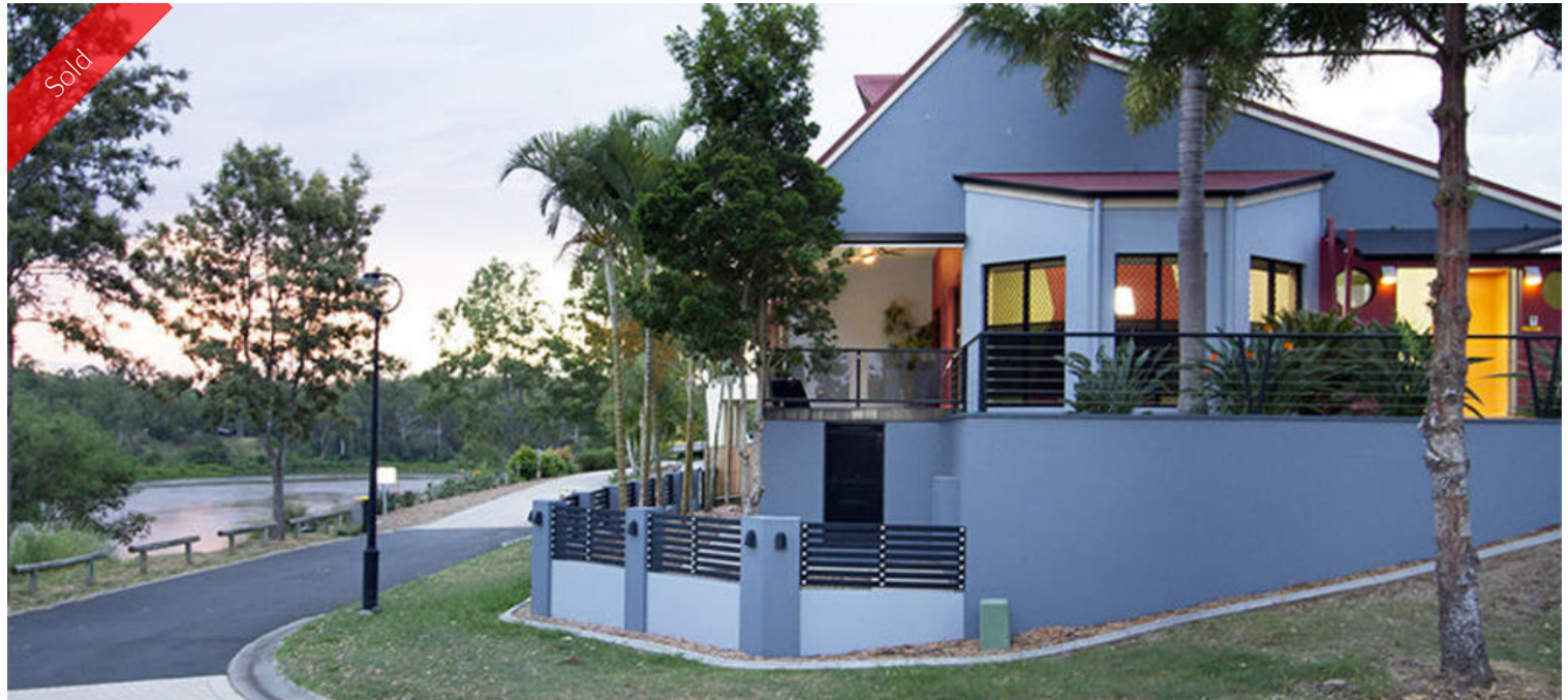
25 Rivervista Street, Riverhills