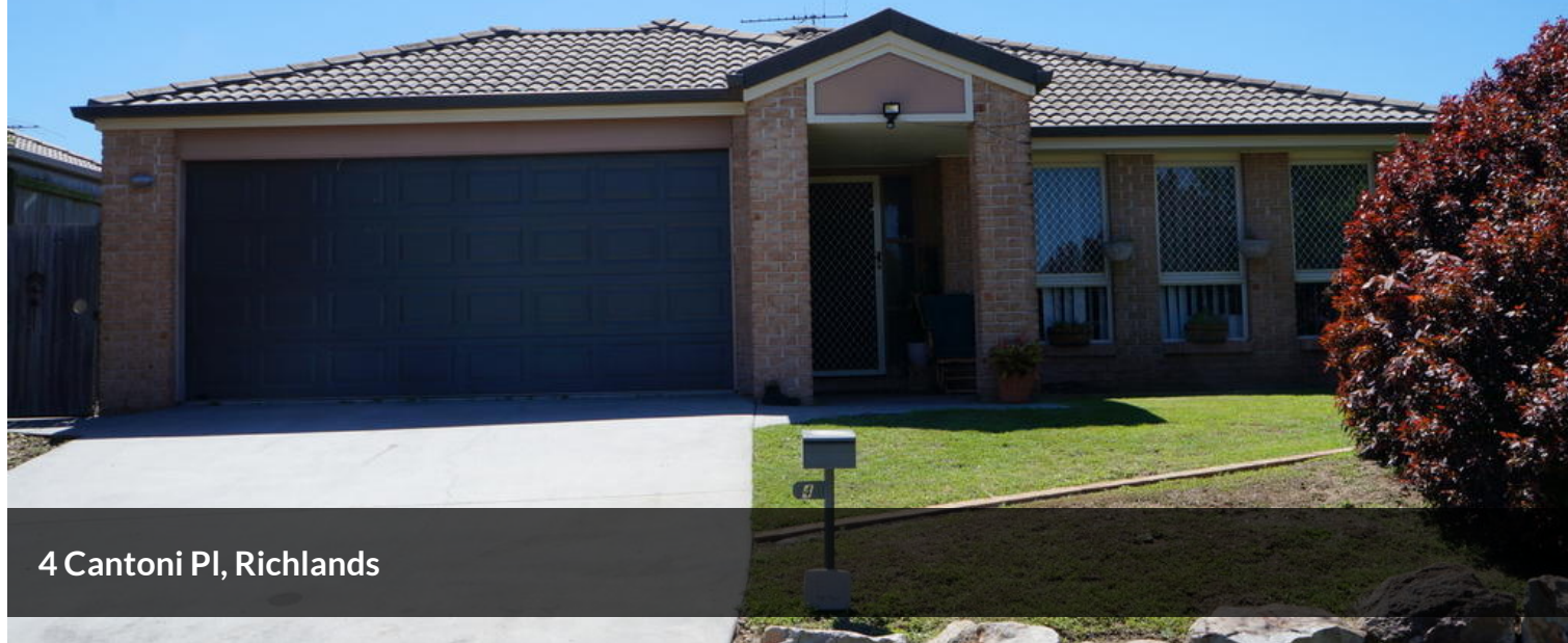
4 Cantoni Pl, Richlands