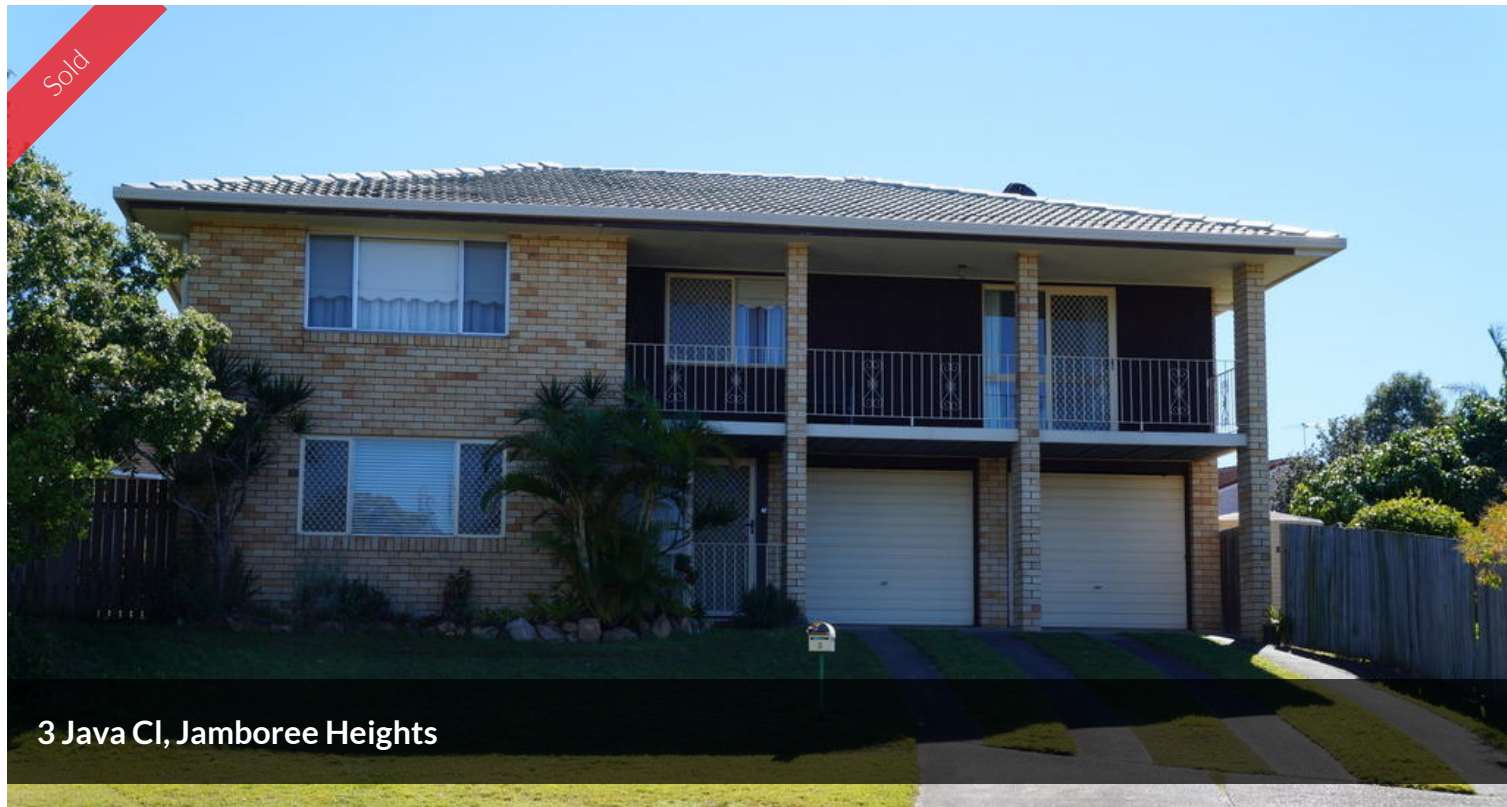
3 Java Cl, Jamboree Heights